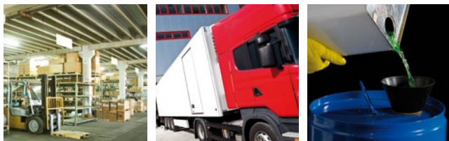
* The B-EX4T2 was benchmarked against competitor products in stand-by mode.